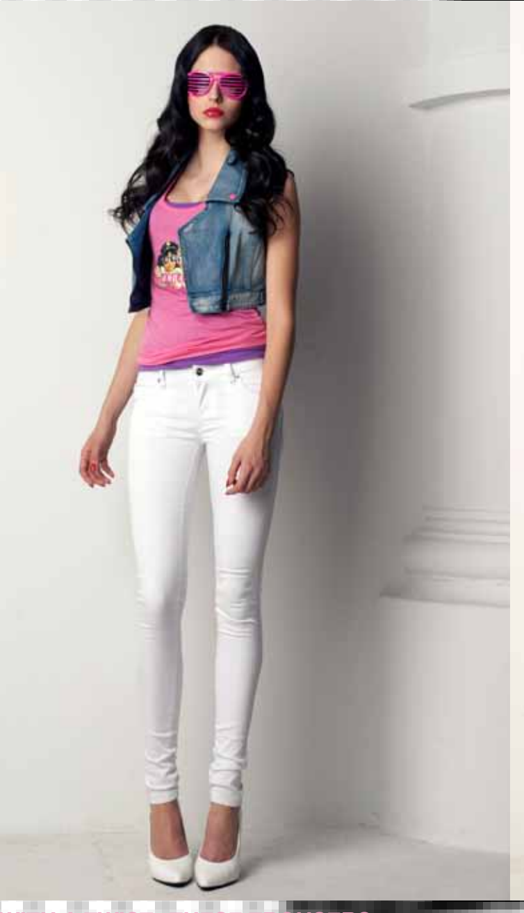
DENIN WITH ATWIST, THESE THOUSERS WILL TAKE YOU ANYWHERE - FROM DAY INTO NIGHT, PINK BUTTON DETAILING AND A UNIQUE ANKLE TREATMENT! URN CASUAL INTO KNOCK OUT PERFECT WITH THIS CLASSIC FIORUCCIT-SHIFT OR WITH