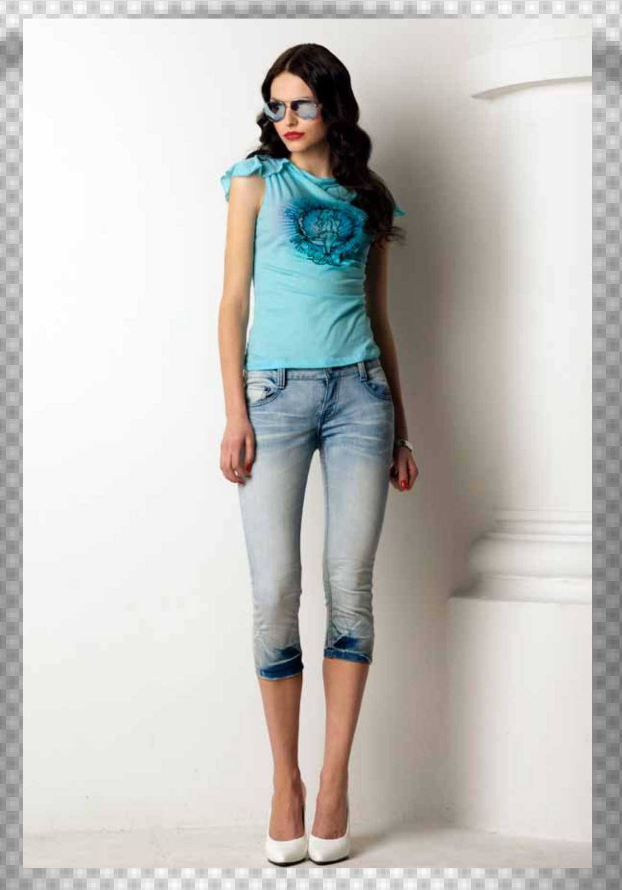
THE LOOK IS IN THE DETAILS. A GATHERED SHOULDER AND THE PERFECT SHADE OF CARIBBEAN BLUE COMBINE FOR AN EFFECT THAT'S COOL AS ICE.