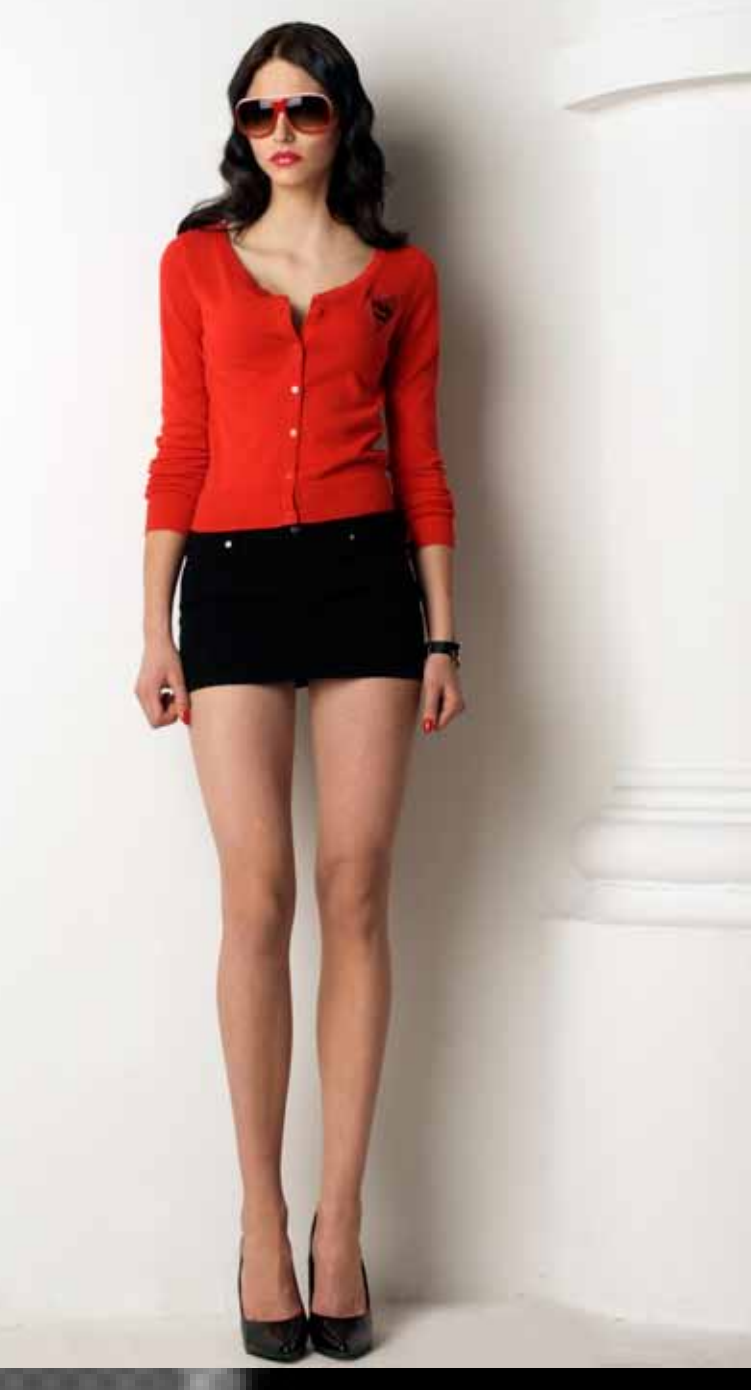
ATTITUDE IS ABOUT MIXING IT UP. OUR BLACK WINT SKIEF BECOMES A COMPLETE LOOK, MITH OCMEINED WITH A CLASSIC, HEAR BINEY A COORDINATED RED BELT. GLASSIG FIGURES POLO SHIRT.