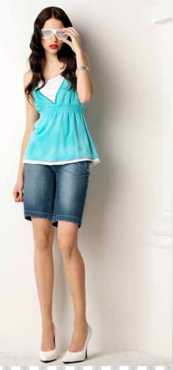
CASUALLY SOPHISTICATED, OUR COMFORTABLE TURQUOISE TOP GOE ANYWHERE AND WITH ANYTHING.

THIS LIGHT-WEIGHT CARDIGAN IS PEFECT ALMOST YEAR-ROUND AND IS SURE TO MAKE ANY SEASON HOT